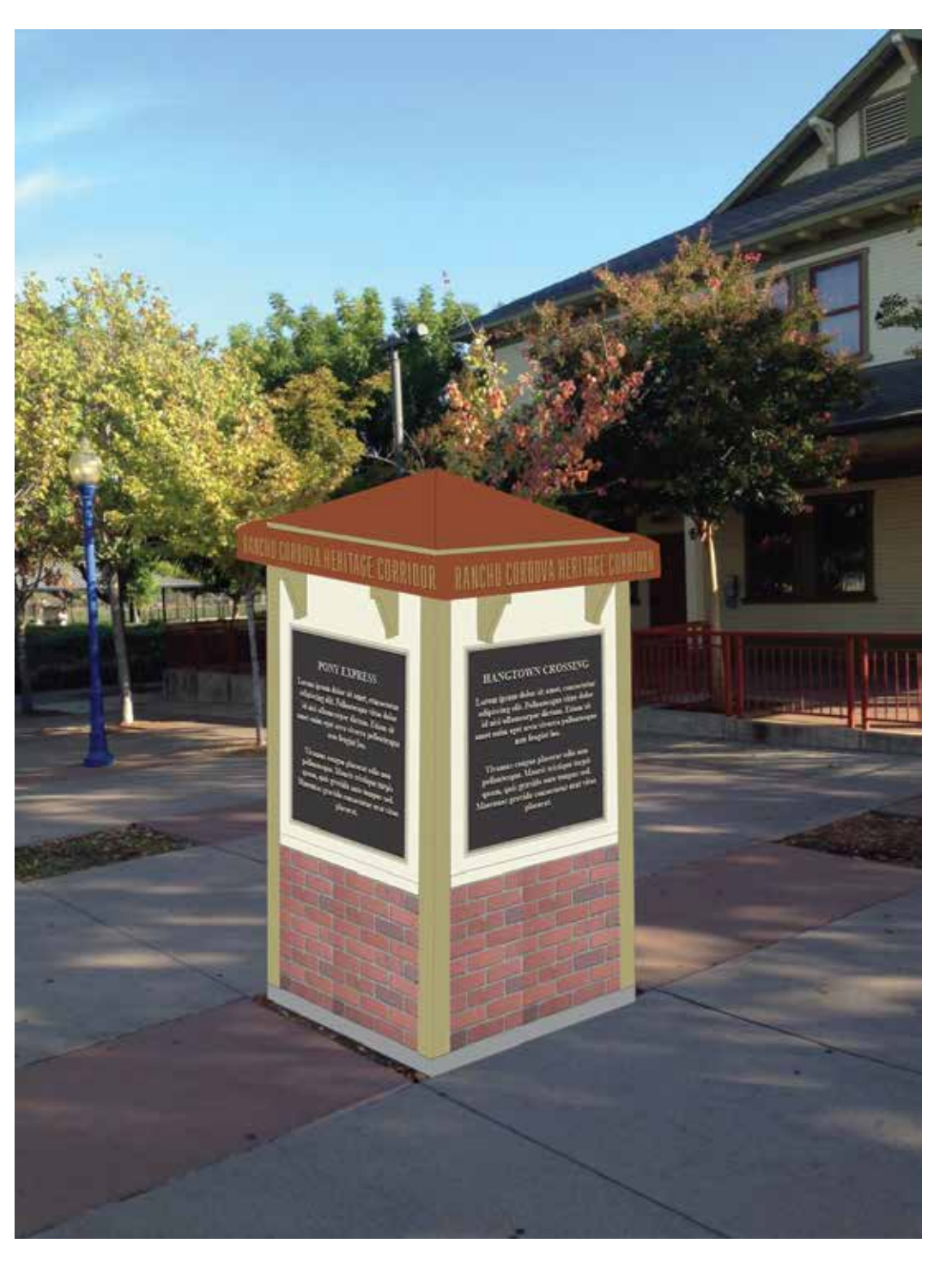
Proposed Kiosk Sign